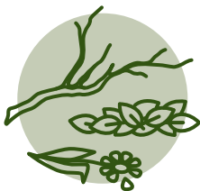
GARDEN AND PARK WASTE