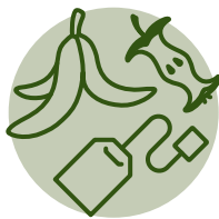
FOOD AND KITCHEN WASTE